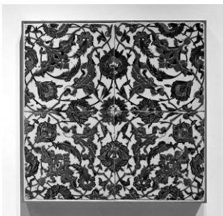
A ceramic tile (16 th century)