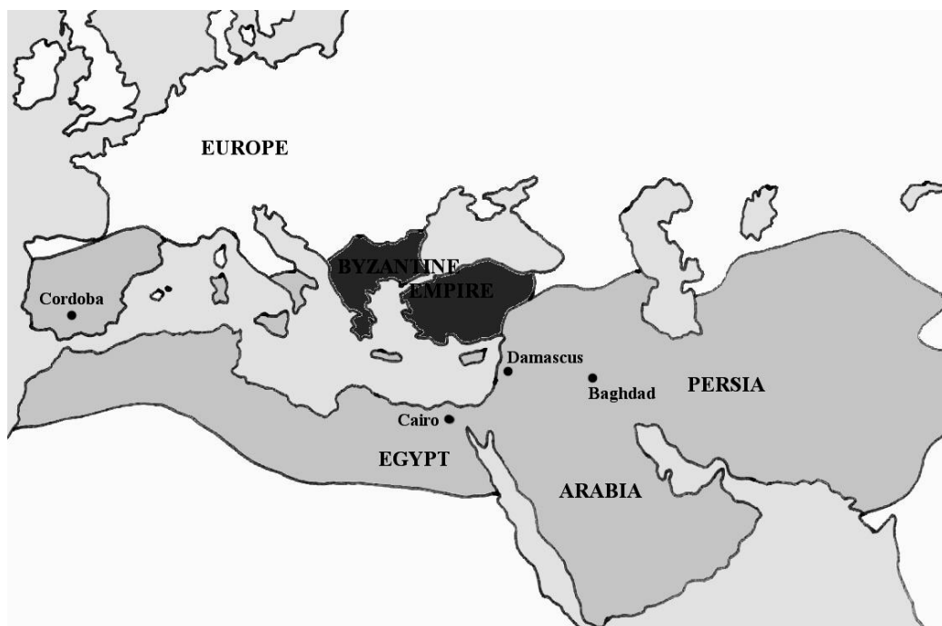
Muslim world around 750 AD

TASK 4: Use your knowledge to find at least four reasons or causes of the rapid Arab expansion: (logical, practical, geographical or historical)