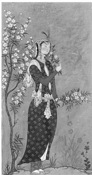
A woman with flowers (16 th century)