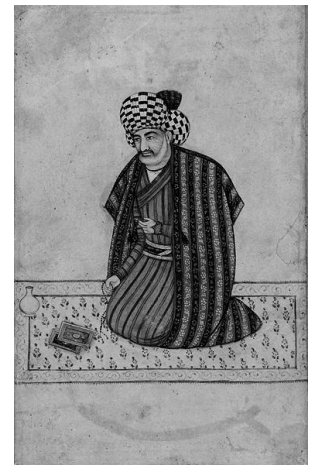
A portrait (17 th century)