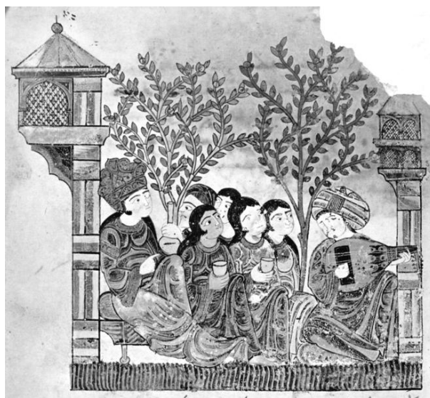
A painting, listening to music (13 th century)