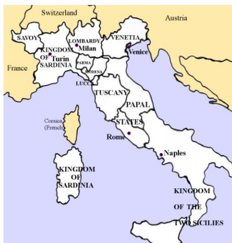
Territories acquired 1859-1869