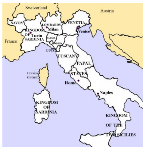
The Kingdom of Sardinia in 1815

TASK 16: Take a colour pencil and mark the states which were part of the united Italy in its different stages of unification: