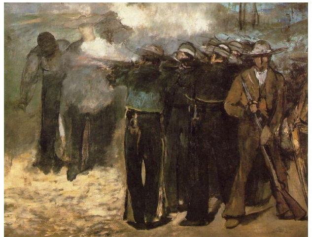
Maximilian's execution, by Edouard Manet