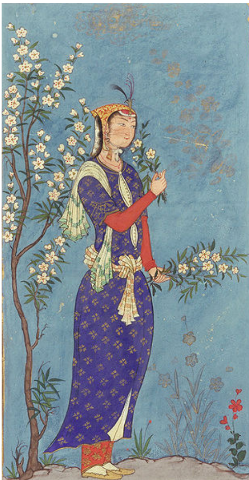
A woman with flowers (16 th century)