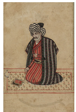
A portrait (17 th century)