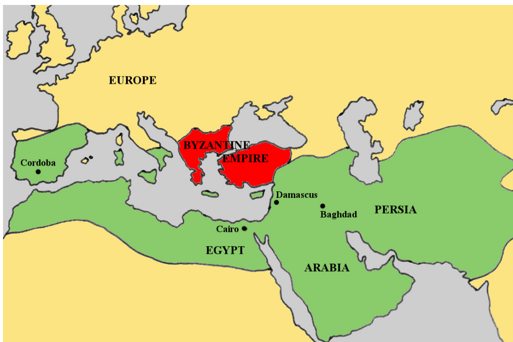
Muslim world around 750 AD

TASK 4: Use your knowledge to find at least four reasons or causes of the rapid Arab expansion: (logical, practical, geographical or historical)