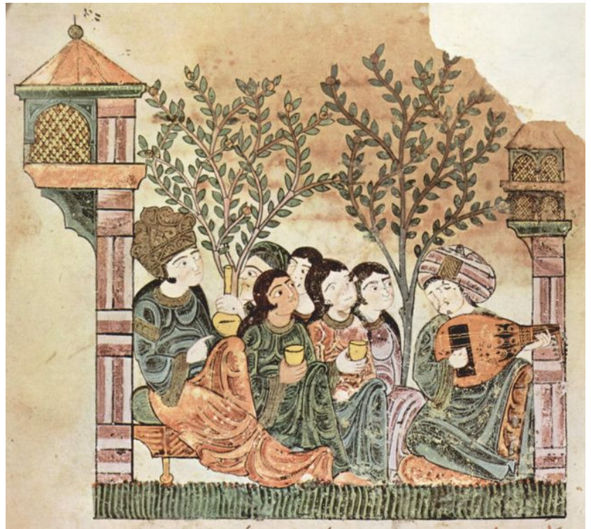
A painting, listening to music (13 th century)