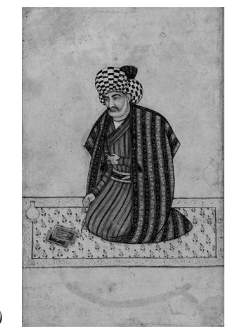
A portrait (17<sup>th</sup> century)