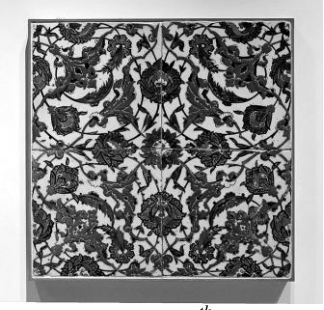
A ceramic tile (16<sup>th</sup> century)