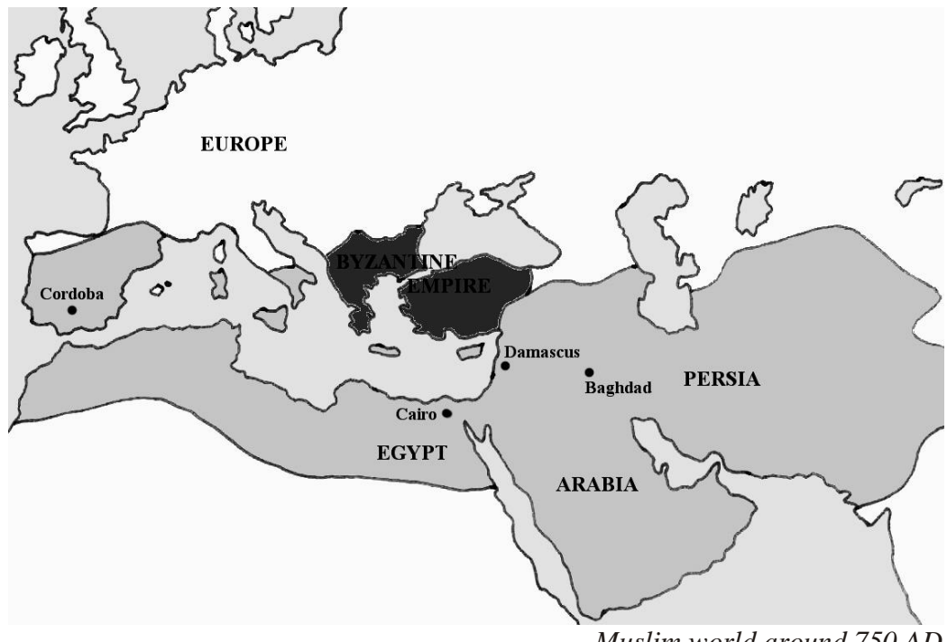
Muslim world around 750 AD