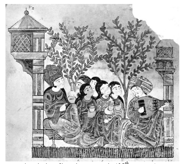
A painting, listening to music (13<sup>th</sup> century)