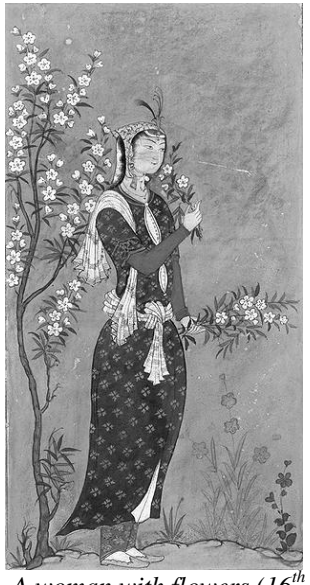
A woman with flowers (16<sup>th</sup> century)