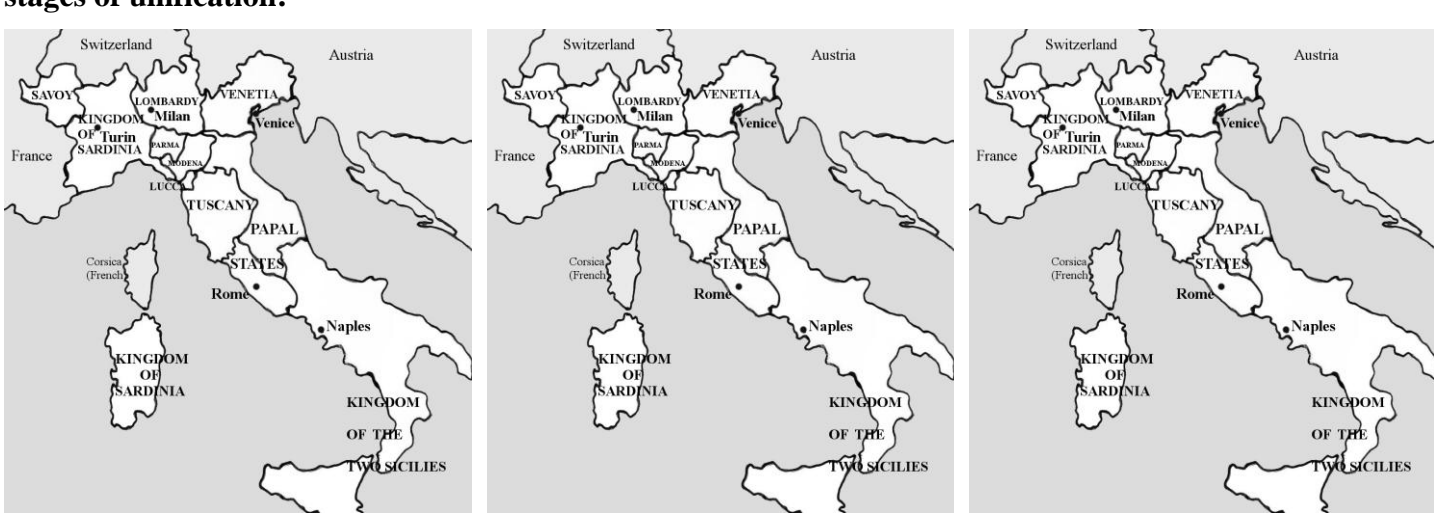
TASK 16: Take a colour pencil and mark the states which were part of the united Italy in its different stages of unification:

In 1871 Rome became the official capital of Italy.