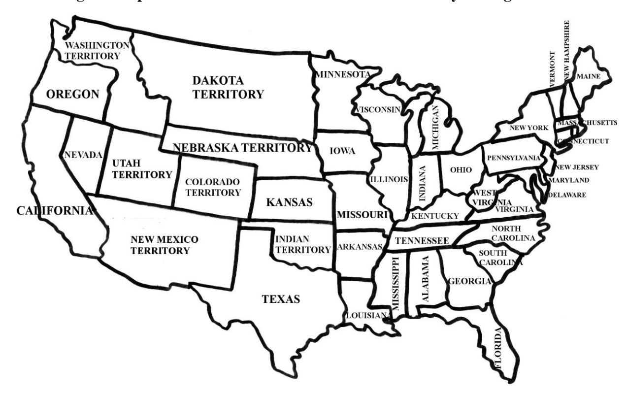
TASK 4: On the given map mark the states of the Union and Confederacy – using two different colours.